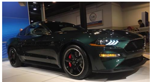
MCOH members at the Houston Auto Show on Press Day with the new Bullet.